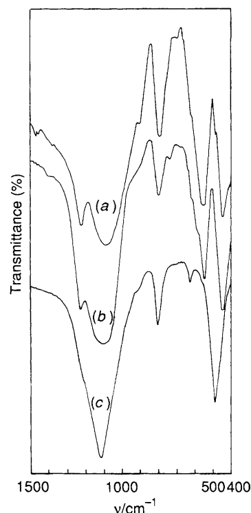
Fig. 2 IR spectra of (a) the original chromosilicate sample, (b) the sample treated with oxygen at 693 K, (c) the sample treated with oxygen at 843 K

The yellow colour of the calcined chromosilicate strongly suggests that Cr VI is bonded to extraframework O 2- ligands forming anionic species like CrO 4 2- or Cr 2 O 7 2- . It is probable that the anchored and activated Cr 2 O 3 species incorporate oxygen to form CrO 3 which is then hydrolysed during the rehydration of the zeolite. In fact, washing the sample with cold water leads to the easy and almost quantitative extraction of the chromates. The chromates were identified in the extracts by the precipitation of the reddish-brown Ag 2 CrO 4