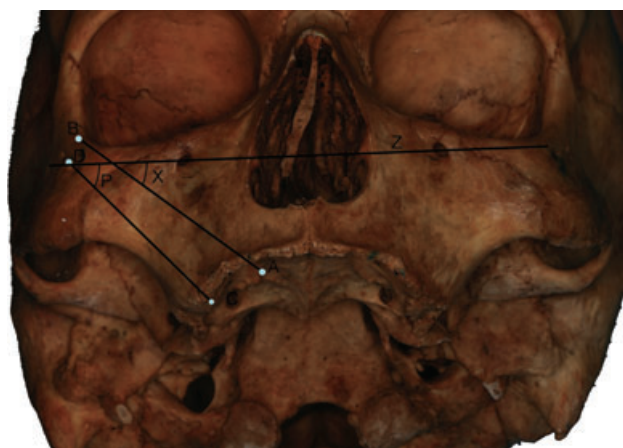
Figure 3 Skull frontal view showing the points A, B, C, and D; the lines AB and CD; and the angles X and P.