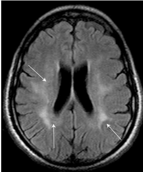
FIG. 1. FLAIR-enhanced image showing confluent lesions seen in some HTLV-I-infected patients (arrows indicate lesions, which extend from periventricular to subcortical locations).

found a high rate of WM lesions in carriers. The distribution and quantity of WM lesions were not different between groups. No correlations with clinical findings, including EDSS or OMDS scores, were found.