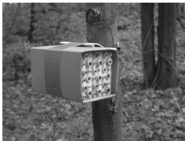
Fig. 1 Nest box constructed from a 2-l milk carton ( 9.5 \times 9.5 \times 16.5 cm 3 ) with a polystyrene piece. Each box contained 36 cardboard trap-tubes; nine of each 3, 5, 7 and 9 mm internal diameters \times 15 cm length

Each site contained two forms of the nest boxes, as three boxes were artificially covered and three were left un-covered. As reported by Taki et al. (2004), these two types were included to see if the covering technique would provide more opportunities for insects to colonize the trap-nests. However, since the same numbers of trap types were set at all of the eight sites, and because the goal of this study was comparisons among