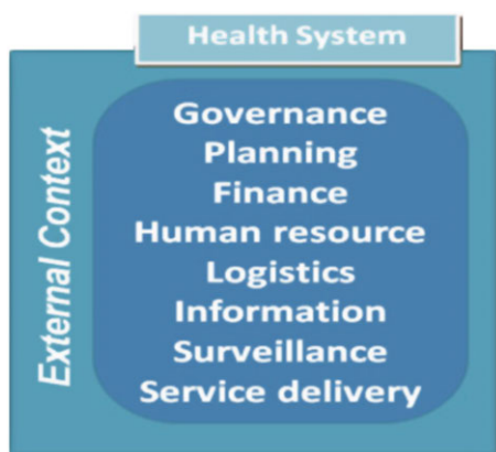
Figure 1. Health systems framework used in the study.

Methods for collecting primary data included key informant interviews, focus group discussions (where appropriate), and staff profiling surveys. Fieldwork took place between November 2009 and April 2010. In each country, interviews were conducted at national level and at service delivery level in either one or two selected districts. Key informants were selected on the basis of their experience in