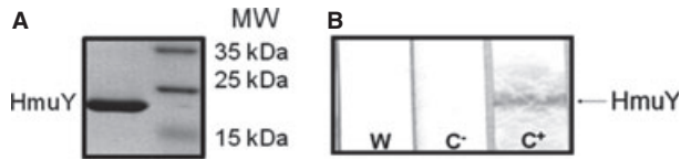
Fig. 2. Western blotting profile of Porphyromonas gingivalis HmuY. The protein was over-expressed, purified from Escherichia coli cell lysate, analyzed for purity using sodium dodecyl sulfate–polyacrylamide gel electrophoresis and Coomassie Brilliant Blue staining (A), and then detected by probing with serum antibodies from controls and patients (B). A pool of sera from nonperiodontitis control subjects was used as a negative control (C - ) and a pool of sera from patients with chronic periodontitis was used as a positive control (C + ). The white strip (W) was incubated with 1% bovine serum albumin only. This experiment was carried out three times and representative data are shown.

finding that Pg LPS induces higher levels of IL-10 in subjects with periodontitis is in agreement with the fact that this particular molecule participates in the signaling of an anti-inflammatory pathway. In contrast, stimulation with antigens derived from a strain of P. gingivalis that does not produce HmuY results in lower levels of IL-1 \beta and IL-10, suggesting that HmuY is crucial for their production.