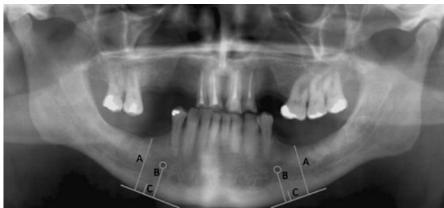
Fig. 2 Panoramic radiograph showing the measurements in PMI (B/C) and MI (C)

The intraobserver kappa agreement values demonstrated high reproducibility (0.84 for MCI, 0.94 for MI, 0.91 for PMI, and 0.79 for increased spacing of the trabecular bone). In comparing groups with equivalent ages (I and III; II and