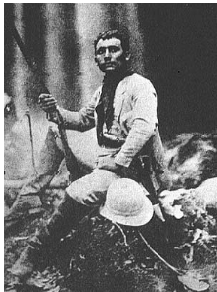
Figure 2: The young Cândido Mariano da Silva Rondon in Amazonia, before 1891 (picture in the public domain).

To the Chairman of the Norwegian Nobel Committee, 22.V.25