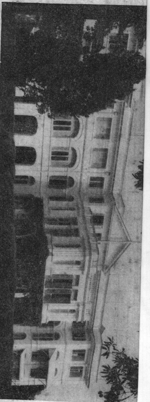
Government House, Lagos.

In the early days of colonial rule the administration was chiefly concerned with the maintenance of law and order,