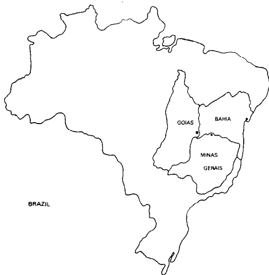
Fig. 3. States of Brazil in which the one T. cruzi isolate was obtained. São Felipe (BA) 5 isolates (Type II); Mambáí (GO) 4 isolates (Type II); Montalvania (MG) 8 isolates (Type III).

zymodeme I. It is interesting to note that all the strains isolated from Montalvania belong to Type III and that most of the human isolates from the nearby area of the São Francisco valley displayed the pattern of zymodeme I, as showed by BARRETT et al. (1980). Regarding the correlation of Type II and zymodeme II, it should be noted that these groups include T. cruzi strains from São Felipe (Bahia) area, which is the